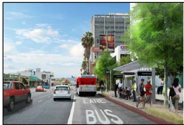
Figure 4. Dedicated BRT Lane at Transit Stop

The North Hollywood to Pasadena Corridor is a highly populated area that gets more than 700,000 vehicle trips per day, making it LA County's most heavily traveled corridor without a premium bus service. The Corridor is currently served by the Metro Express Line 501 and the LA Department of Transportation (DOT) Commuter Express 549. However, these bus routes have seen low ridership because they do not provide convenient access to key activity centers or offer competitive travel times to the automobile. 22