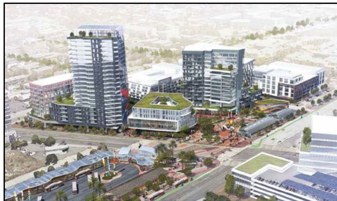
Figure 1. North Hollywood Station TOD Proposal

By connecting neighborhoods with community and employment centers through a network of pedestrian, bicycle, transit, and roadway facilities, TOD reduces automobile dependence, traffic congestion, air pollution and greenhouse gas emissions. Figure 1 illustrates an example of TOD from a recent proposal for the North Hollywood transit station.