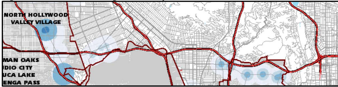
Figure 6. TOD Districts along North Hollywood to Pasadena Corridor.