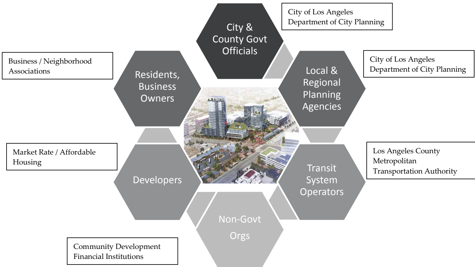
Figure 2. Key Stakeholder Groups