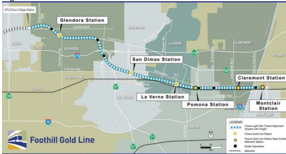
Figure 7. Foothill Gold Line Extension Route 41